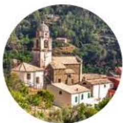
Vladislav I 2 reviews